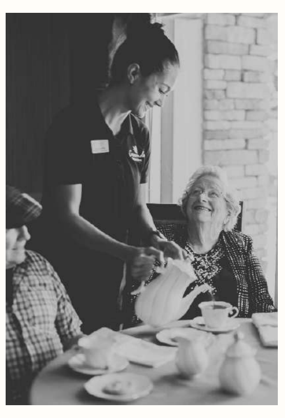
NUMEROUS SOCIAL FACTORS SUCH AS BEING MARRIED, HAVING A SENSE OF TRUST AND SECURITY IN THE COMMUNITY, AND PARTICIPATING IN RELIGIOUS ORGANIZATIONS ARE ALSO ASSOCIATED WITH GOOD NUTRITIONAL STATUS.

Furthermore, impaired social support networks are not only associated with increased risk for mortality but also poor nutritional behaviors.